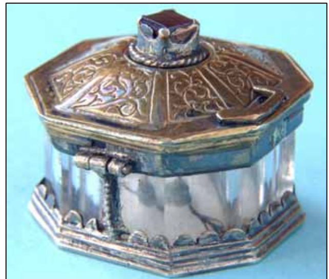
Rock crystal dial with a ruby at its apex