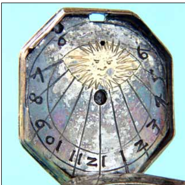
The gilt Sun's face on the rock crystal dial