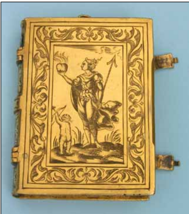
'Front cover' of the book dial with images of Venus and Cupid

and scrolls. Its lid is attractively engraved showing a vase containing flowers.