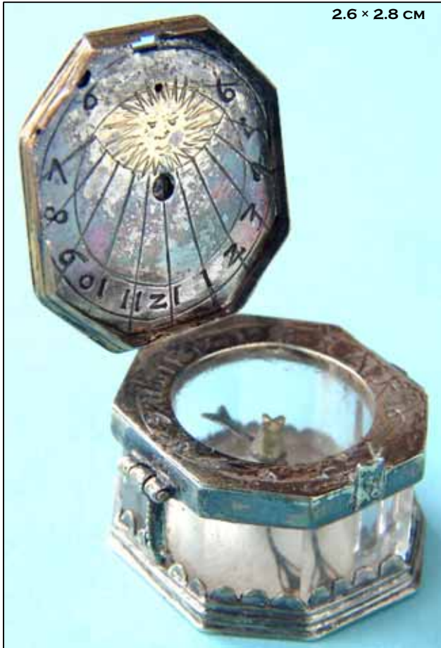
Small early dial with rock crystal body

The first dial illustrated is made of silver with a gilt case. Like most dials of this type it was made for one particular latitude. Although unsigned and undated it was probably made in the sixteenth century in Europe, possibly Southern Germany. Its string gnomon, now missing, throws its shadow onto both horizontal and vertical faces. Note that the vertical face has an attractive gilt Sun's image just below the gnomon fixing hole. The 28 mm diameter body of this dial is made from rock crystal, a particularly transparent type of quartz, resembling glass. Inside it is a simple compass with a paper scale showing only one mark; that of North. With its lid closed, the outside of the dial is gilt with a large ruby placed attractively at its apex. For carrying purposes the dial is housed in a beautifully tooled