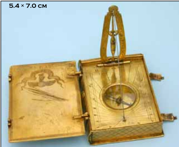
German String Gnomon Dial in the form of a book