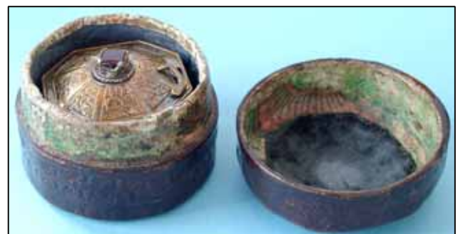
Leather case for the rock crystal dial