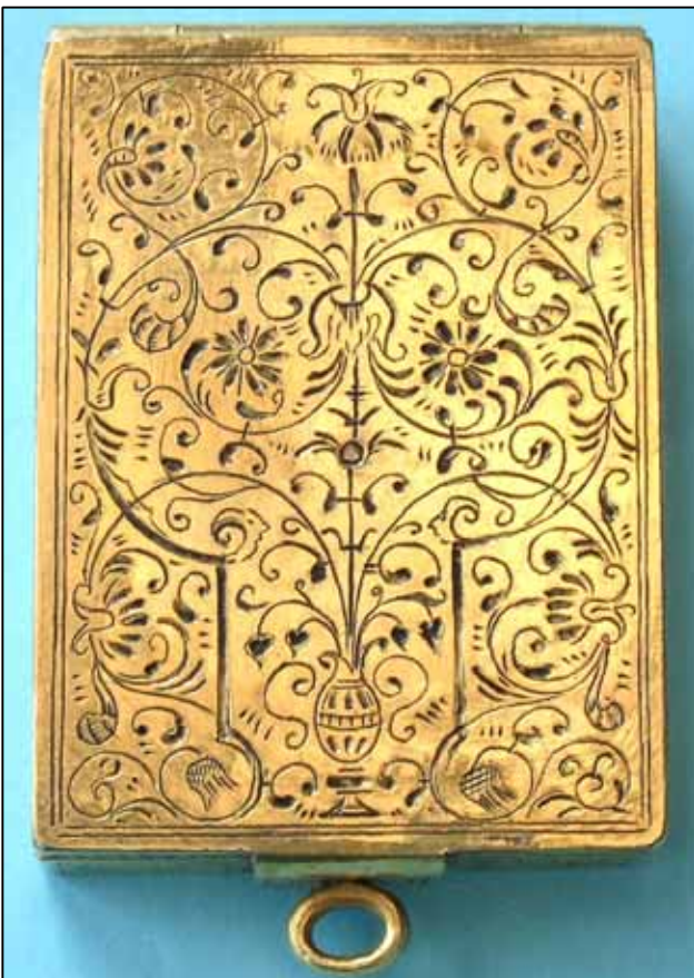
Lid of the Purmann dial showing engraving of a vase with flowers

The dial by Marcus Purmann of Munich is signed simply inside the lid with his initials and date, *M*P* 1593 . Its string gnomon is again only intended for a single latitude. The bracket holding the top end of the gnomon includes a long slender plummet for accurate levelling. Inside its lid is a twice 1 to 12 scale set around a compass rose with a central pointer. It could be used for recording wind directions or as a reminder of times of appointments etc. The brass case is mainly gilt with a silvered dial plate for better shadow contrast. The outside of the case is particularly well engraved with flowers, leaves