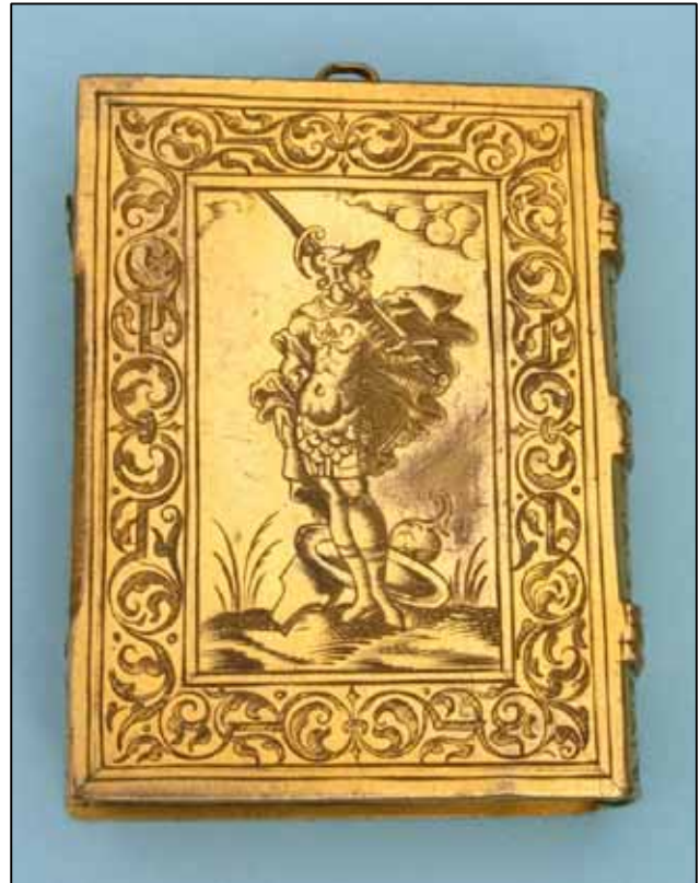
'Back cover' of book dial depicting Mars, the God of War

Occasionally a small String Gnomon Dial will be found on a Finger Ring. For use the lid is opened to