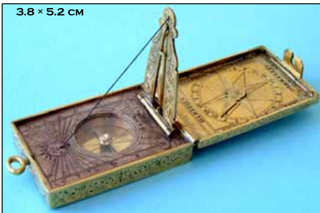
String Gnomon Dial by Marcus Purmann

leather case lined with green velvet. Around the lip of the box is some recycled paper with signs of red and green printing.